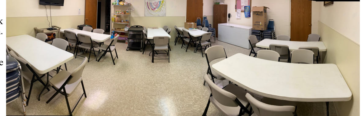
When you have a chance, take a peek in our dining room. You might see the new chairs that will replace the age old ones. This addition was funded by a memorial.

There will be 2 services on Christmas Eve: regular service at 7:00pm and Candlelight Service at 11:00pm.