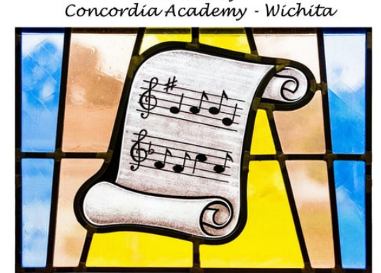
Fríday, November 4 at 7:00 pm Concordía Academy/Immanuel Lutheran Church 909 S Market ~ Wíchíta, KS

You are cordially invited to join us for a concert performed by musicians from the Concordia Academy community, followed by a reception in the fellowship hall.